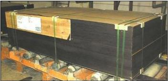
Pic. 6 Plywood pack