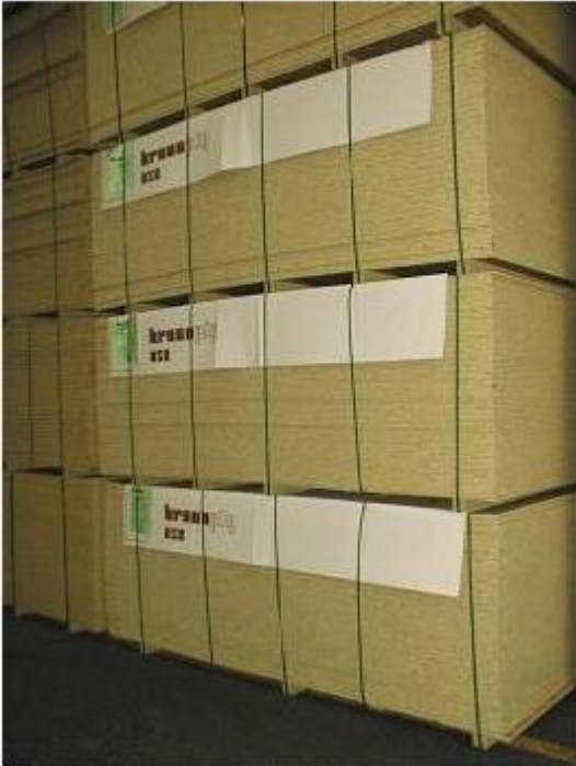
Pic. 5 OSB with bunk and top scrap boards