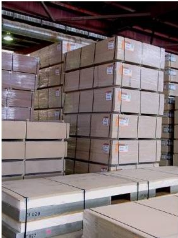
Pic. 1 Steel strapping