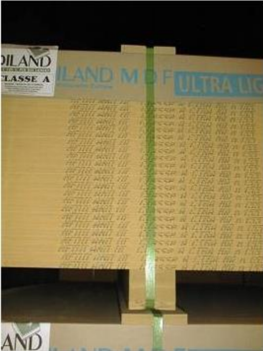
Pic. 3 MDF with bunk and top board and corrugated sheet protection