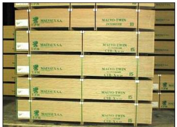
Pic. 2 Steel and PET mixed