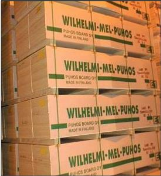
Pic. 7 Particle Boards