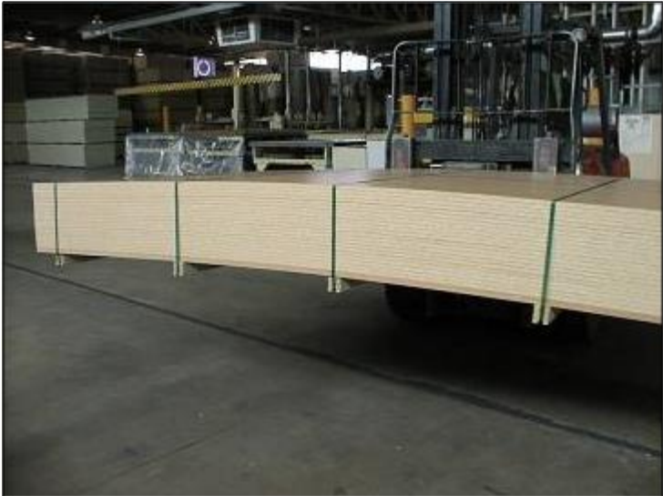
Pic. 8 Test with long pack