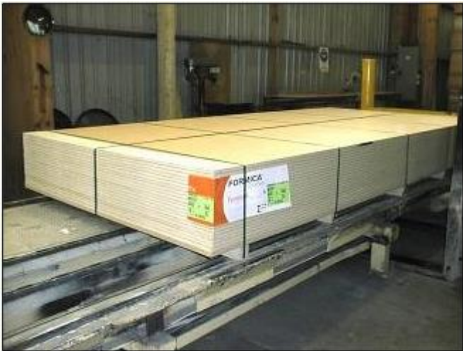
Pic. 9 Particle board with (belly strap)