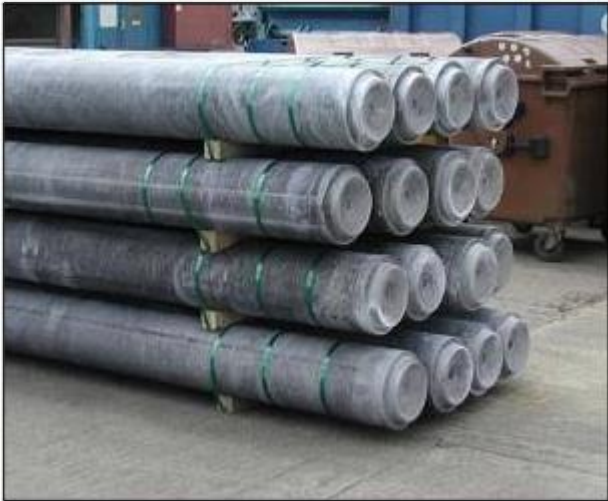
Pic. 4 Large billet Ø