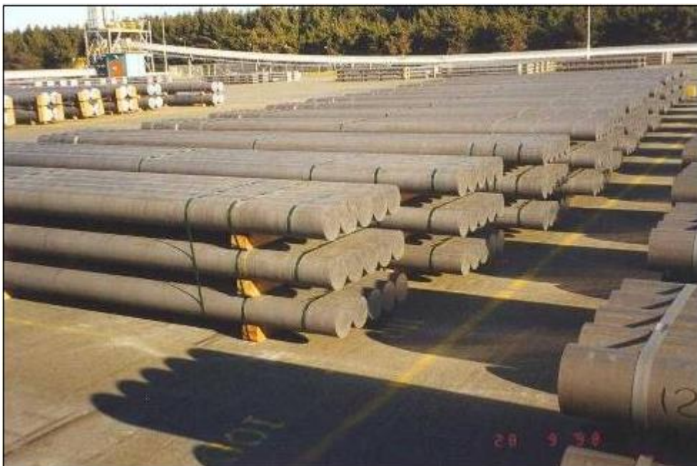
Pic. 1 Strapping of long packs