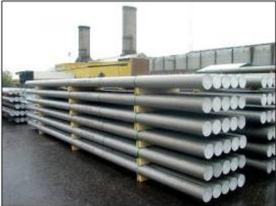
Pic. 2 Two layer stacking