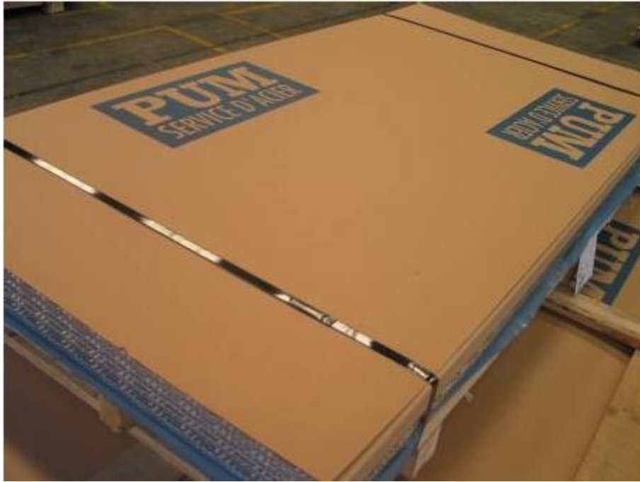
steel plates pack covered with carton board protection