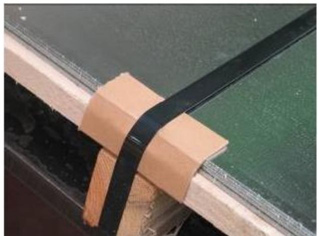
Black PET with corner protection