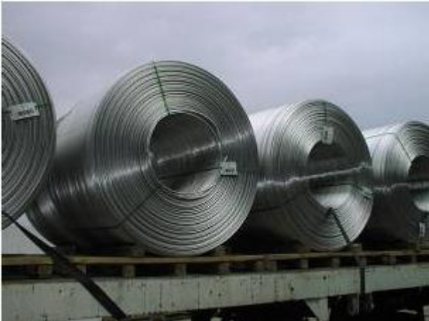
Pic. 3 Transport to port