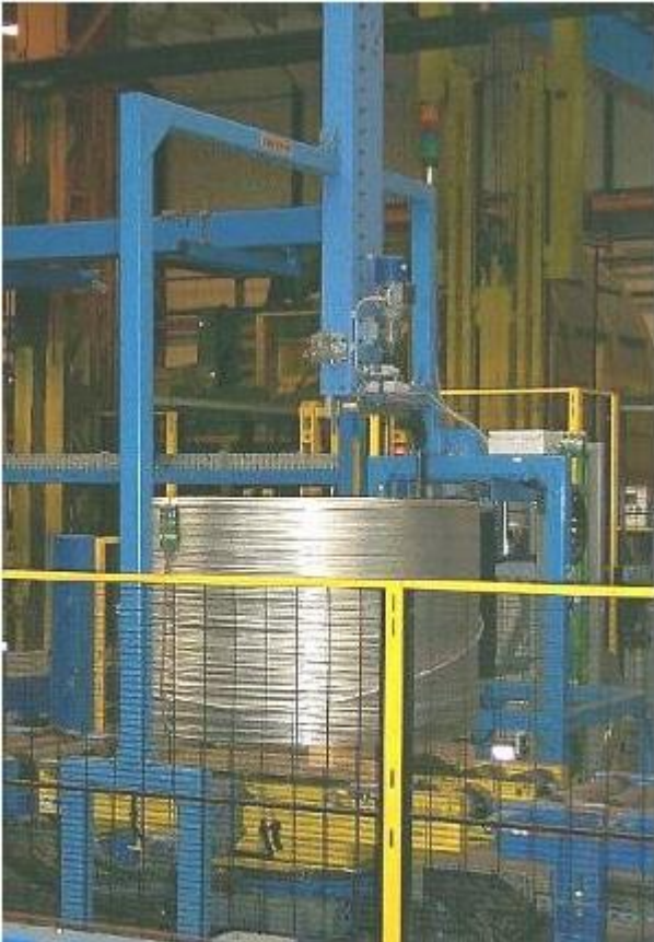
Pic. 5 Automatic side seal PET strapper PM500700