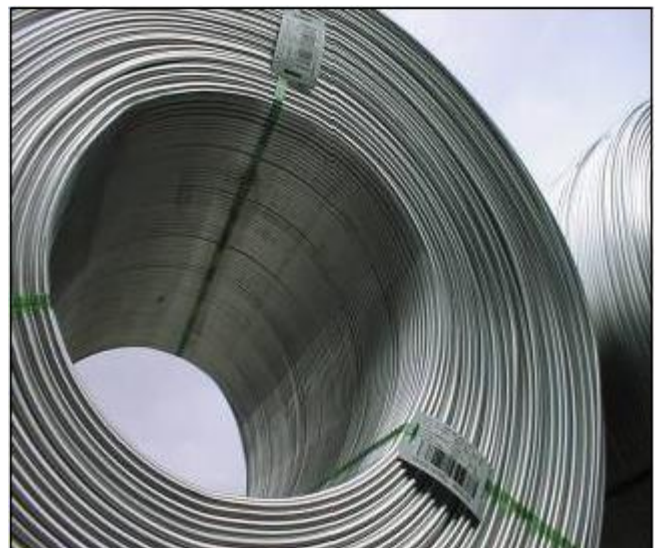
Pic. 2 New packaging